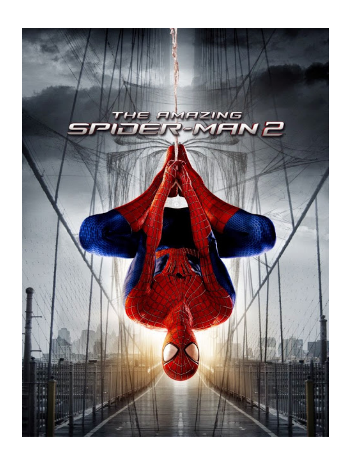
The Amazing Spider Man 2 Full Movie Download In Hindi Mp4